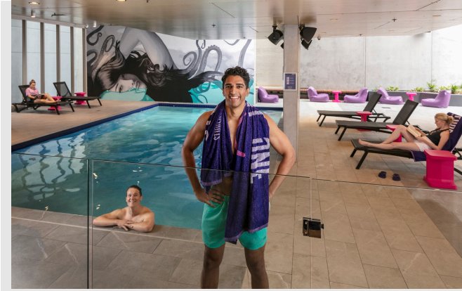
Swimming pool at Student One Wharf Street