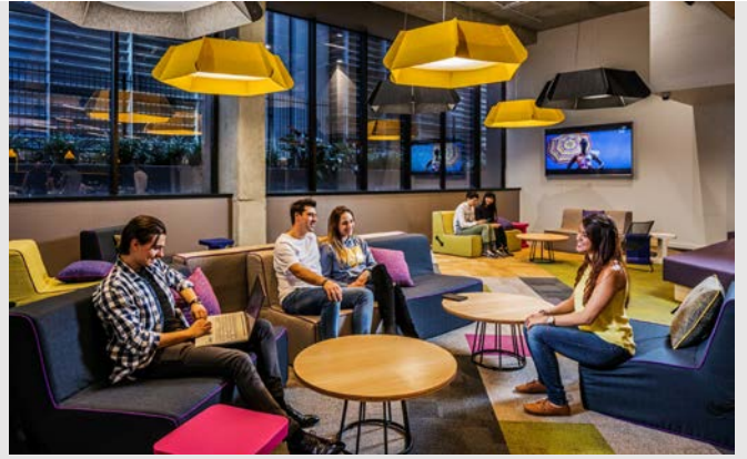
large common space to meet and relax